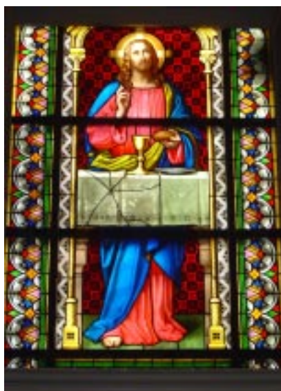
The window above the altar. The shutters are only open on Easter Day.